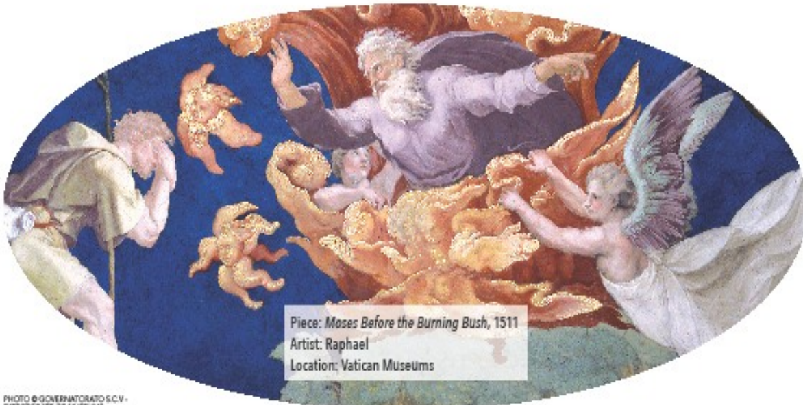
Piece: Moses Before the Burning Bush , 1511 Artist: Raphael Location: Vatican Museums

For Reflection Do I fully appreciate the implications of the resurrection of the body as an element of my faith?