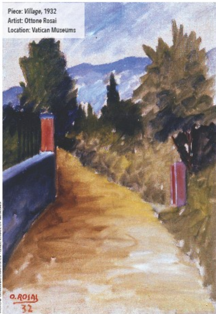
Piece: Village , 1932 Artist: Ottone Rosai Location: Vatican Museums