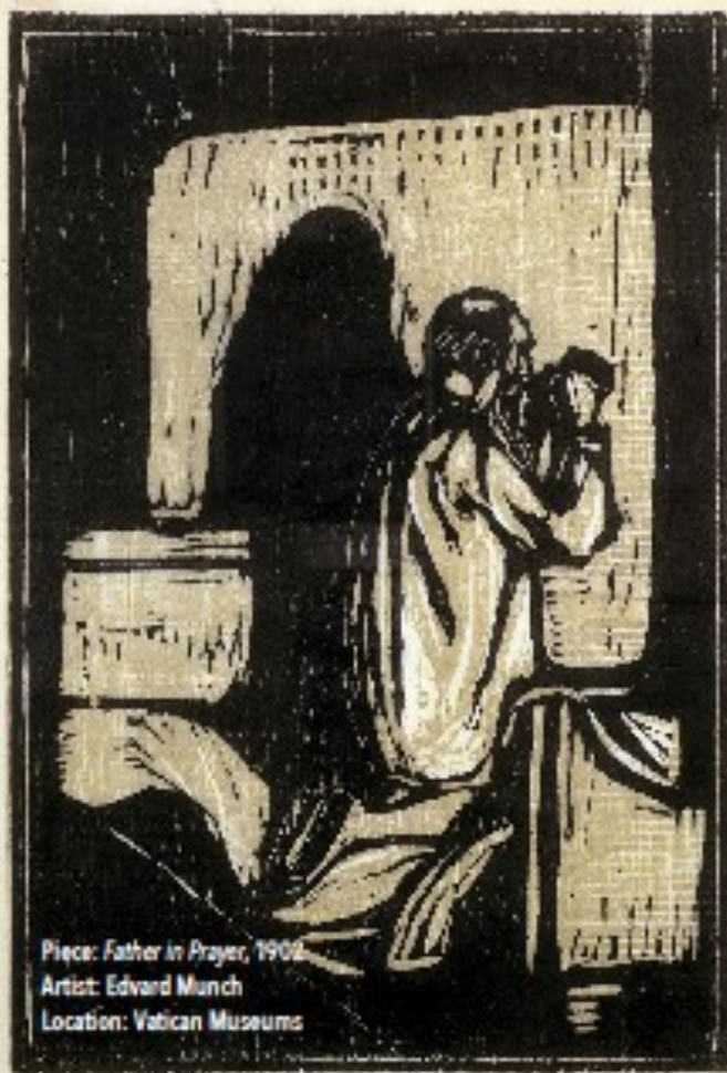
Piece: Father in Prayer, 1900 Artist: Edvard Munch Location: Vatican Museums