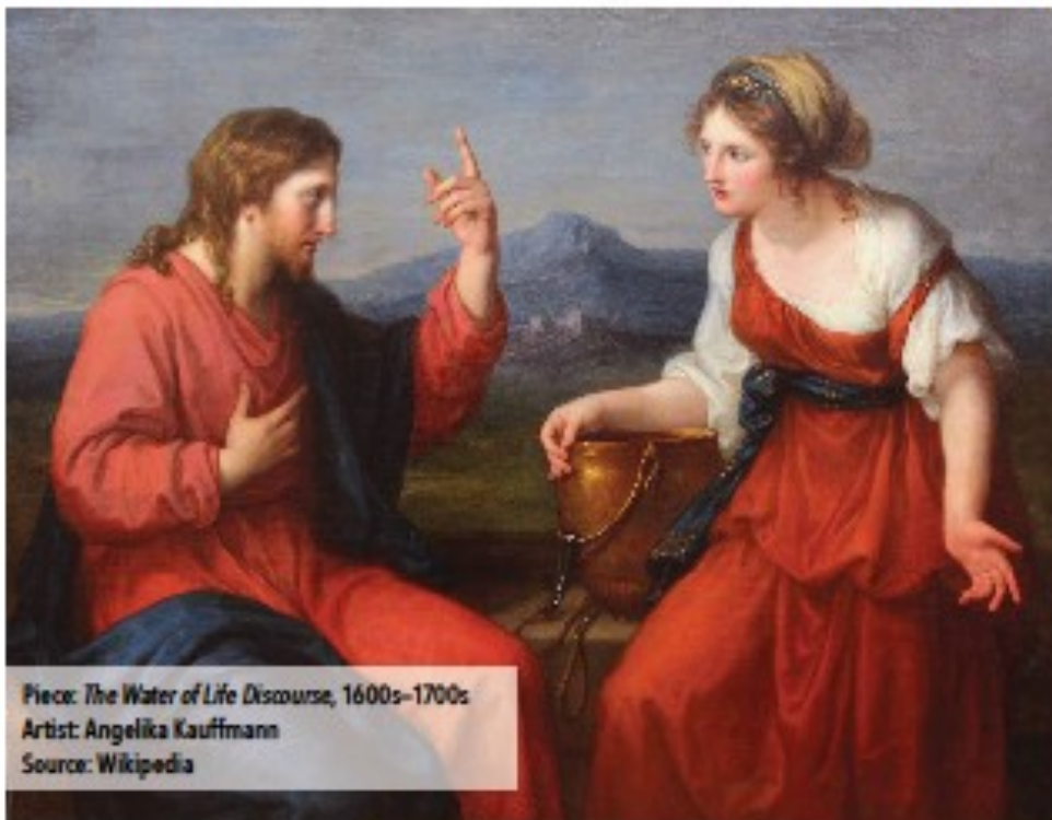
Picture: The Water of Life Discourse , 1600s-1700s Artist: Angelika Kauffmann