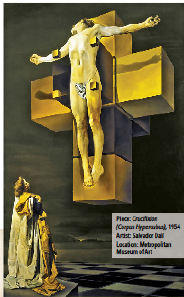
Piece: Crucifixion (Corpus Hypercubus), 1954 Artist: Salvador Dalí Location: Metropolitan Museum of Art