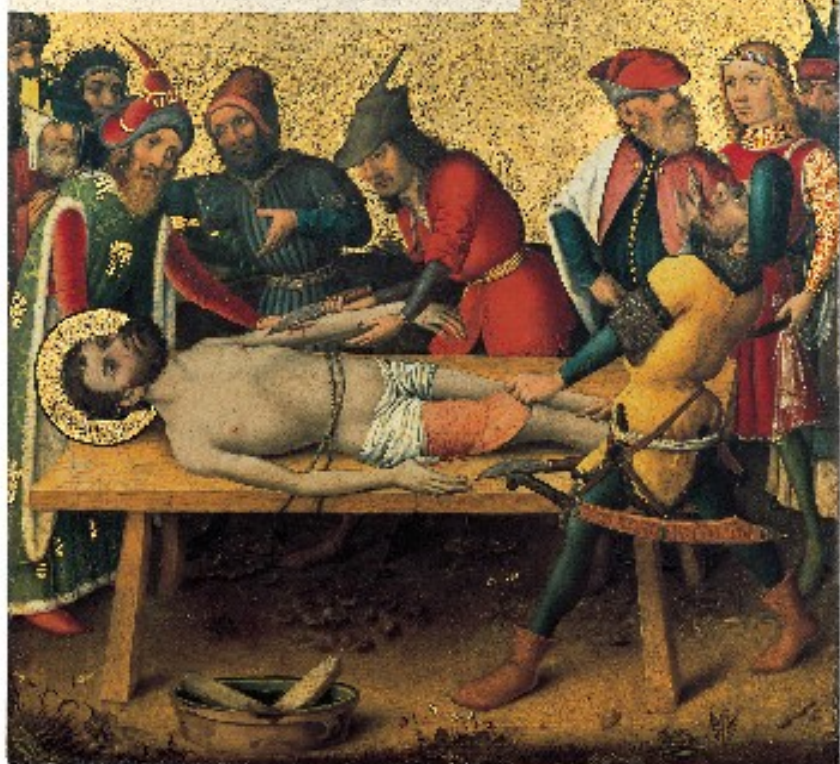
Piece: Martyrdom of St. Bartholomew , fifteenth century Artist: Rhenish School Location: Vatican Museums

bosom was a desire to turn hearts toward his Father. Jesus didn't back down from preaching out of fear of rejection of the gospel. Neither should we.