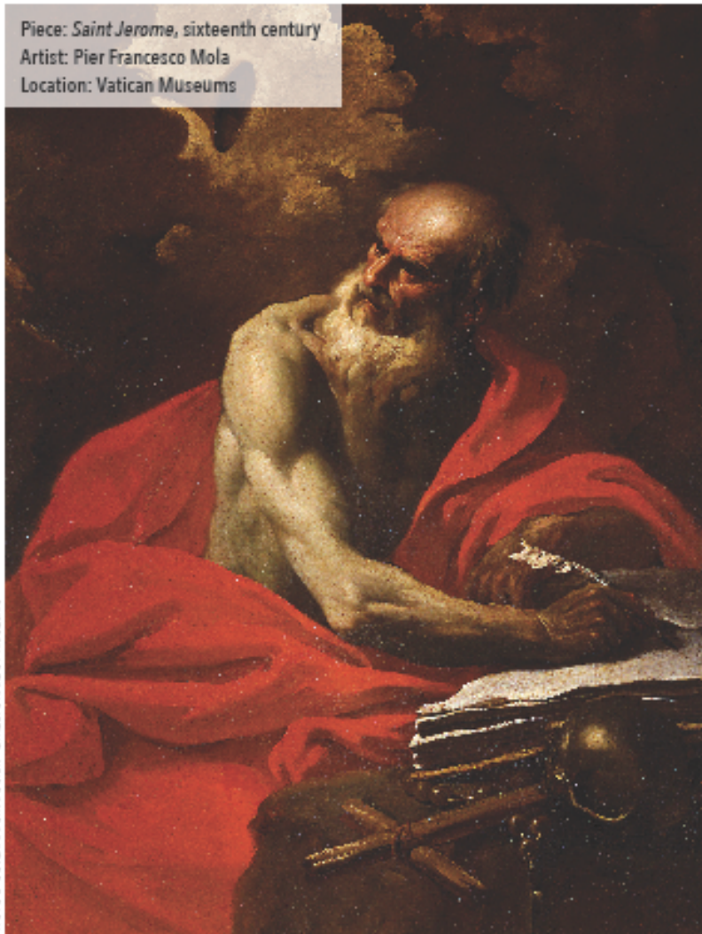
Piece: Saint Jerome , sixteenth century Artist: Pier Francesco Mola Location: Vatican Museums