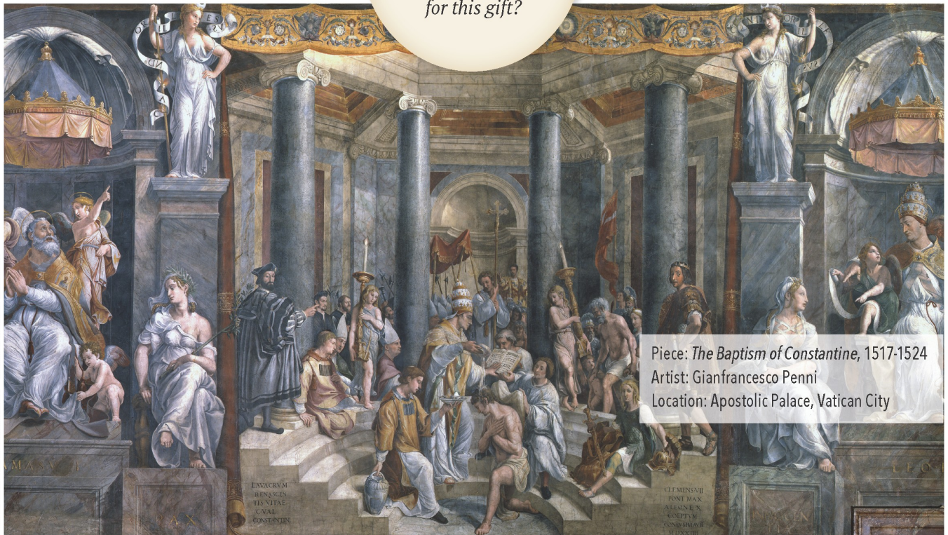
Piece: The Baptism of Constantine , 1517-1524 Artist: Gianfrancesco Penni Location: Apostolic Palace, Vatican City

For Reflection In baptism I became a child of God. Do I give thanks enough for this gift?