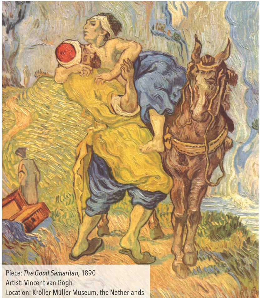
Piece: The Good Samaritan , 1890 Artist: Vincent van Gogh Location: Kröller-Müller Museum, the Netherlands