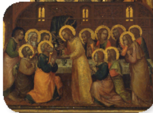
Piece: Stories of the Passion (detail of the Last Supper), circa 1340