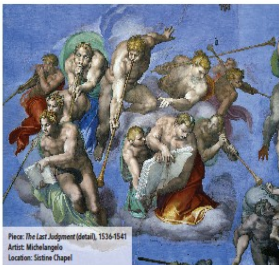
Piece: The Last Judgment (detail), 1536-1541 Artist: Michelangelo Location: Sistine Chapel

The glory of this kingdom isn't in church buildings or organizations, but it's the glory that Jesus mentions in today's Gospel. "Now is the Son of Man glorified, and God is glorified in him" (John 13:31). It's the glory that comes from Jesus' faithful love toward the Father and his disciples, leading him to be enthroned on the cross and rule as the Lamb that was slain yet still