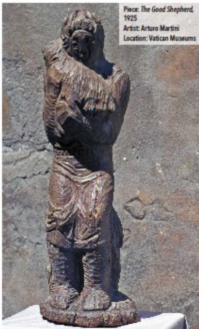
Piece: The Good Shepherd, 1925 Artist: Arturo Martini Location: Vatican Museums