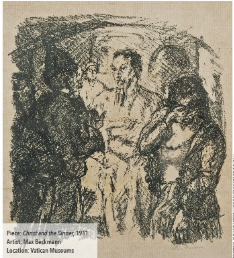
Piece: Christ and the Sinner , 1911 Artist: Max Beckmann Location: Vatican Museums