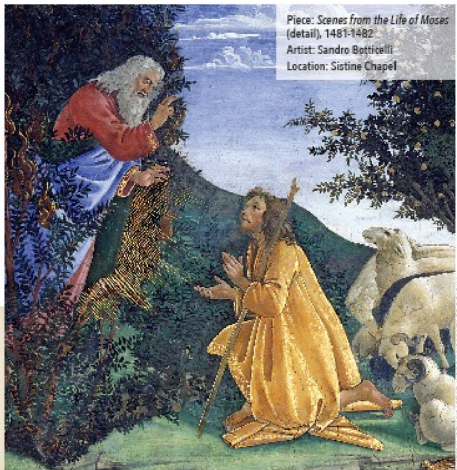
Piece: Scenes from the Life of Moses (detail), 1481-1482 Artist: Sandro Botticelli Location: Sistine Chapel