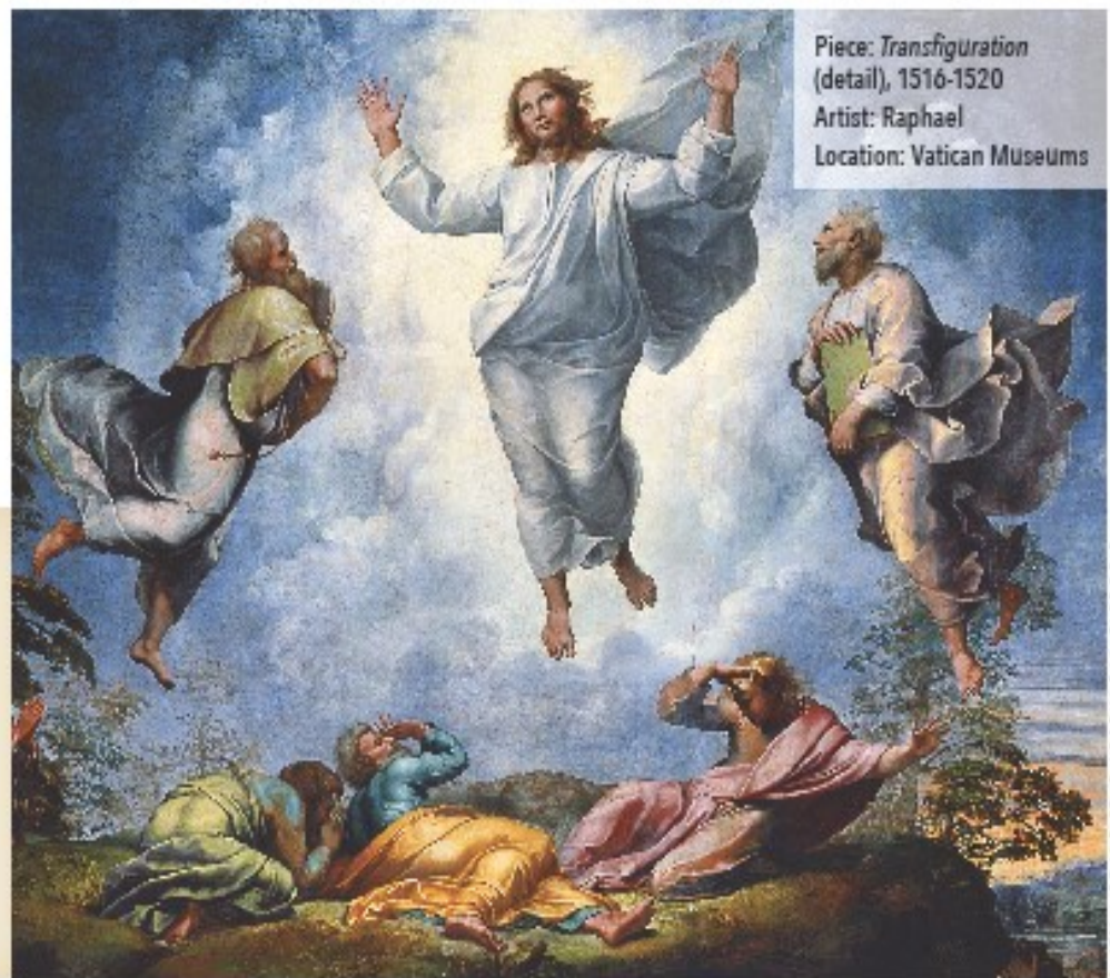
Piece: Transfiguration (detail), 1516-1520 Artist: Raphael Location: Vatican Museums