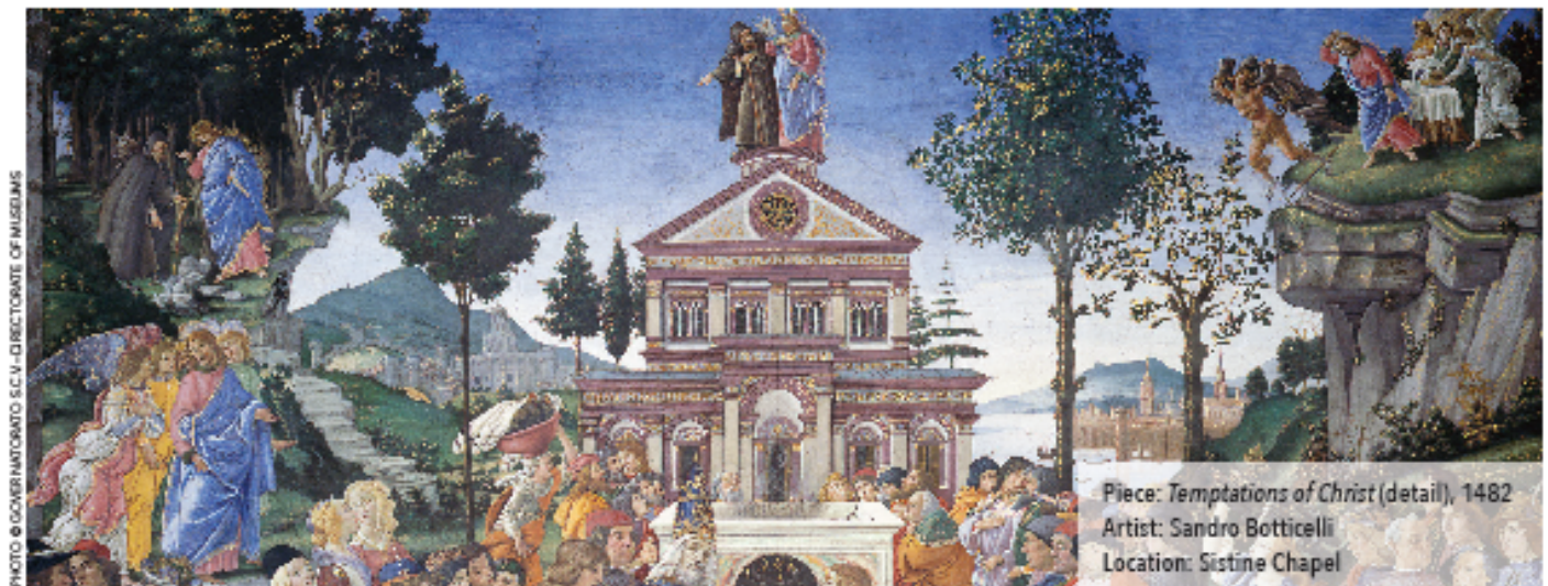
Piece: Temptations of Christ (detail), 1482 Artist: Sandro Botticelli Location: Sistine Chapel

What makes me question God the most? How can God's word and Jesus' passion, death, and resurrection respond to that doubt?