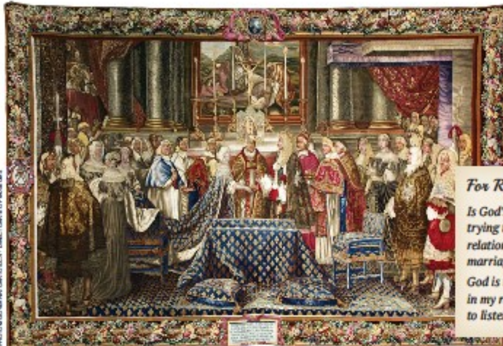
Piece: Tapestry With the Wedding of Emperor Louis XIV, 1725-1728 Artist: Gobelins, after a design by Charles Le Brun Location: Vatican Museums