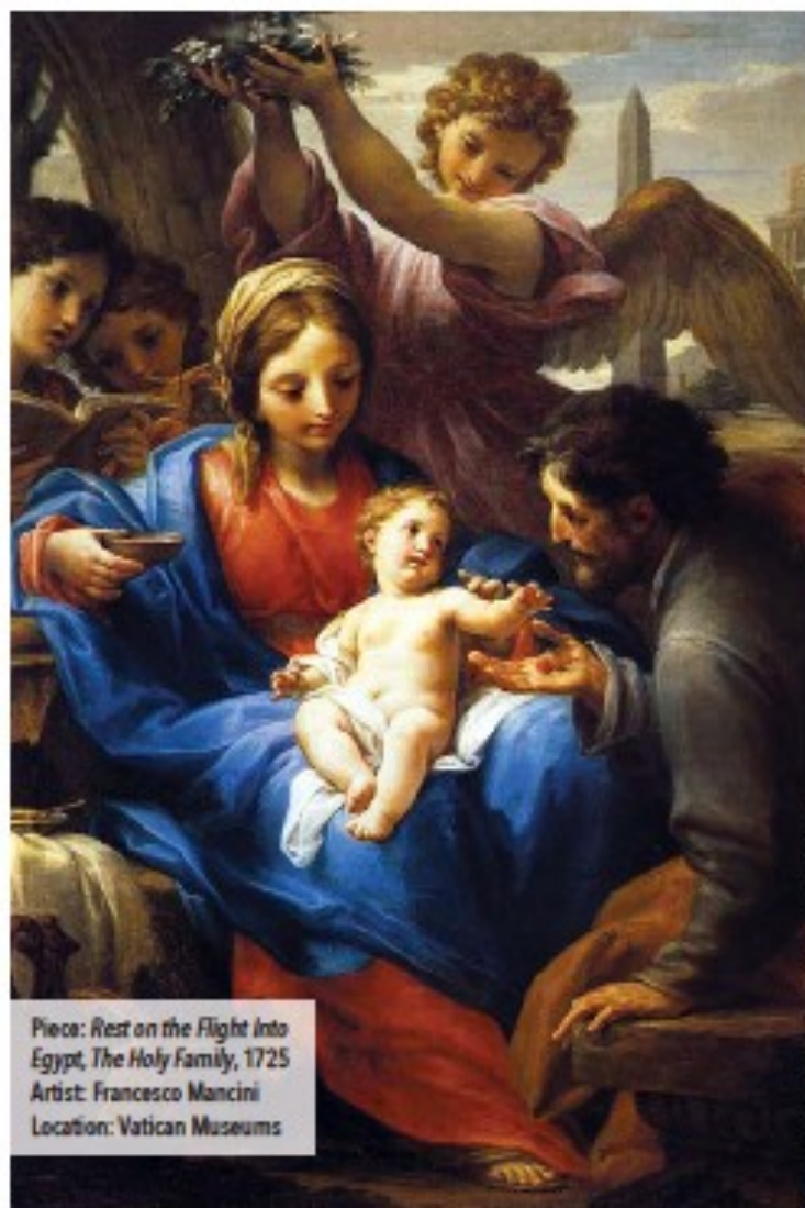
Piece: Rest on the Flight into Egypt, The Holy Family , 1725 Artist: Francesco Mancini Location: Vatican Museums