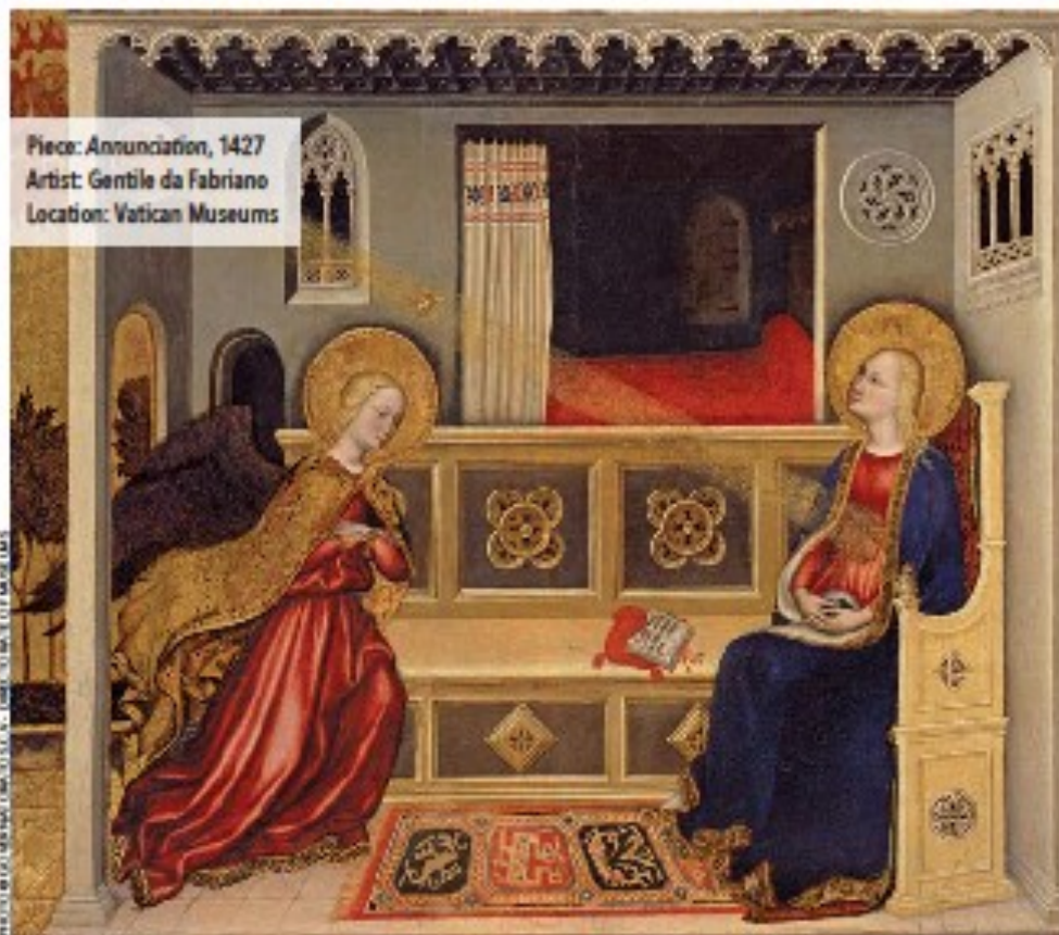
Piece: Annunciation, 1427 Artist: Gentile da Fabriano Location: Vatican Museums