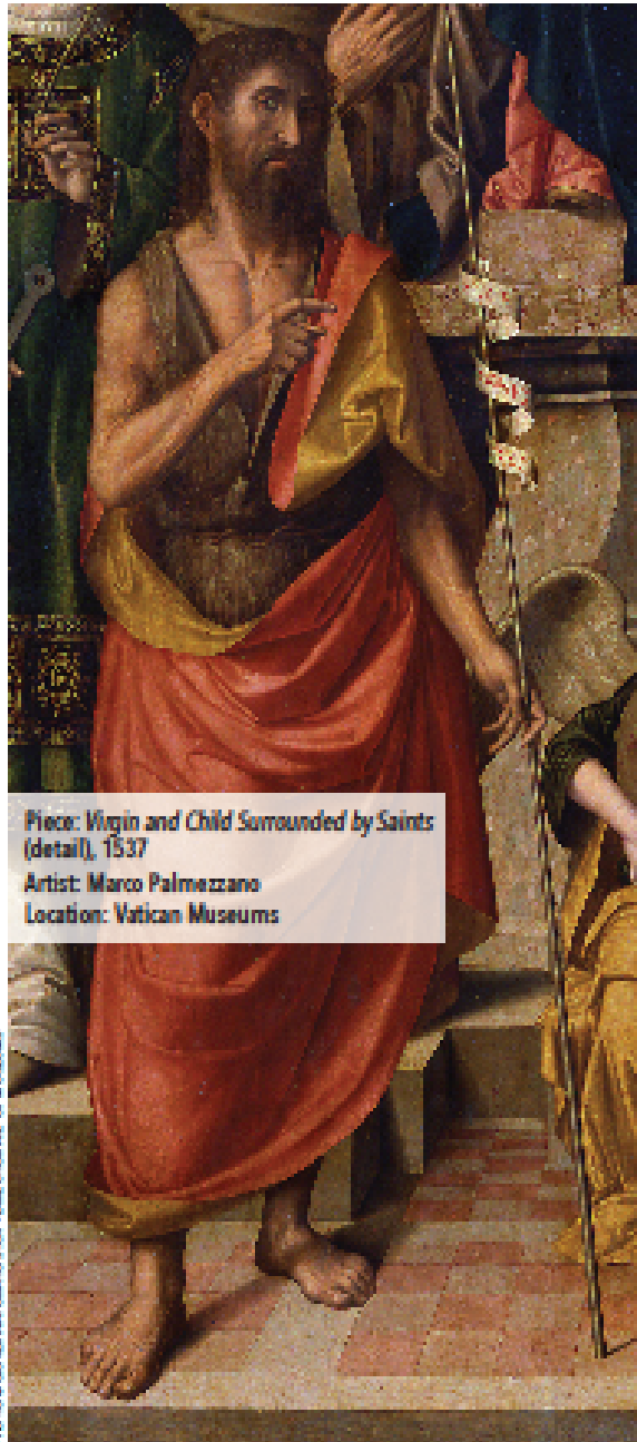
Piece: Virgin and Child Surrounded by Saints (detail), 1537

Artist: Marco Palmezzano Location: Vatican Museums