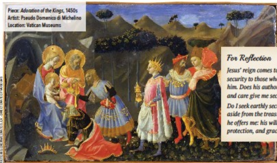
Piece: Adoration of the Kings, 1450s Artist: Pseudo Domenico di Michelino Location: Vatican Museums