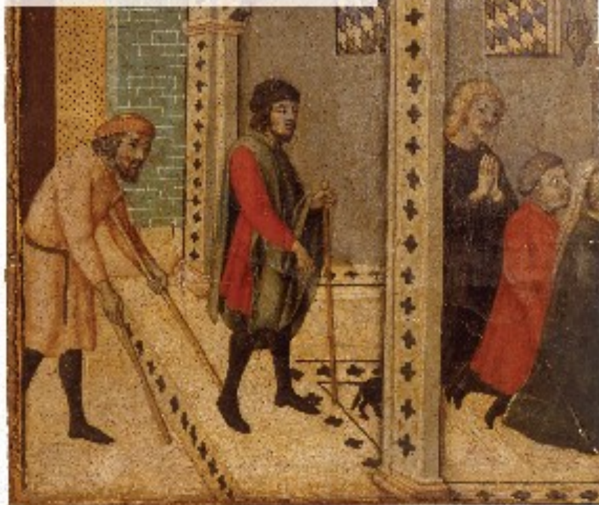
Piece: Scenes from the Legend of St. Peter the Martyr and The Blind and the Lame Pray at the Saint's Tomb (circa 1440) Artist: Sano di Pietro Location: Vatican Museums