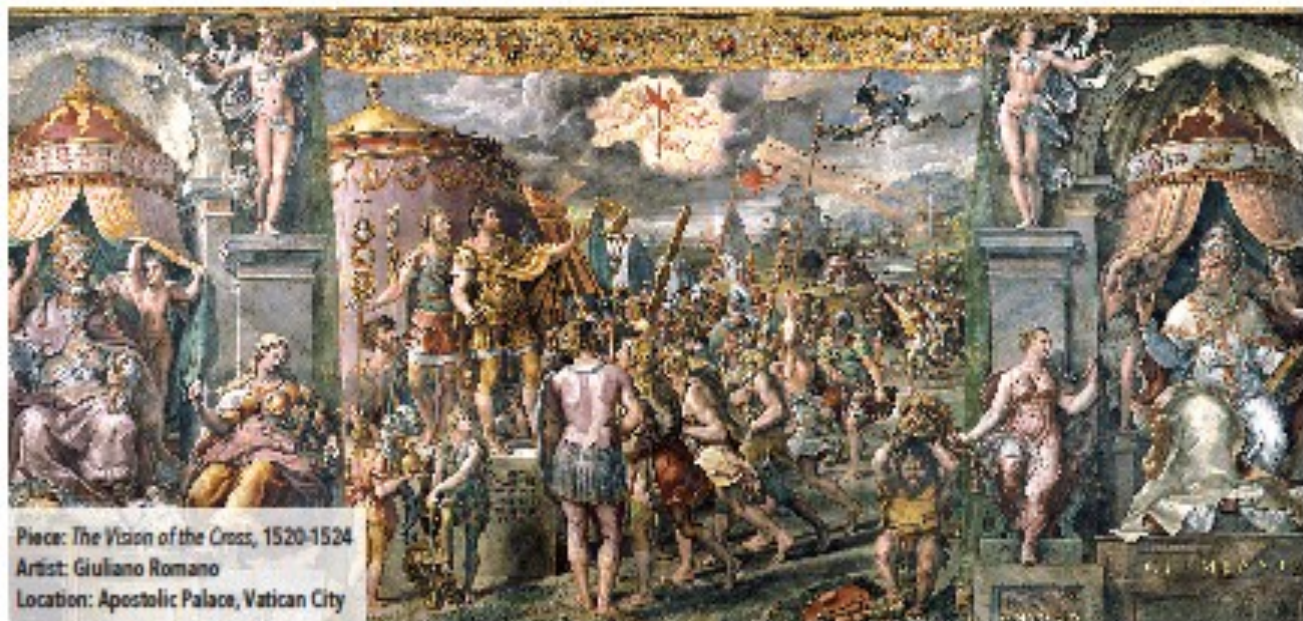
Piece: The Vision of the Cross, 1520-1524 Artist: Giuliano Romano Location: Apostolic Palace, Vatican City

Do I give more credence to fads or feel-good philosophies than to the truth revealed by Jesus?