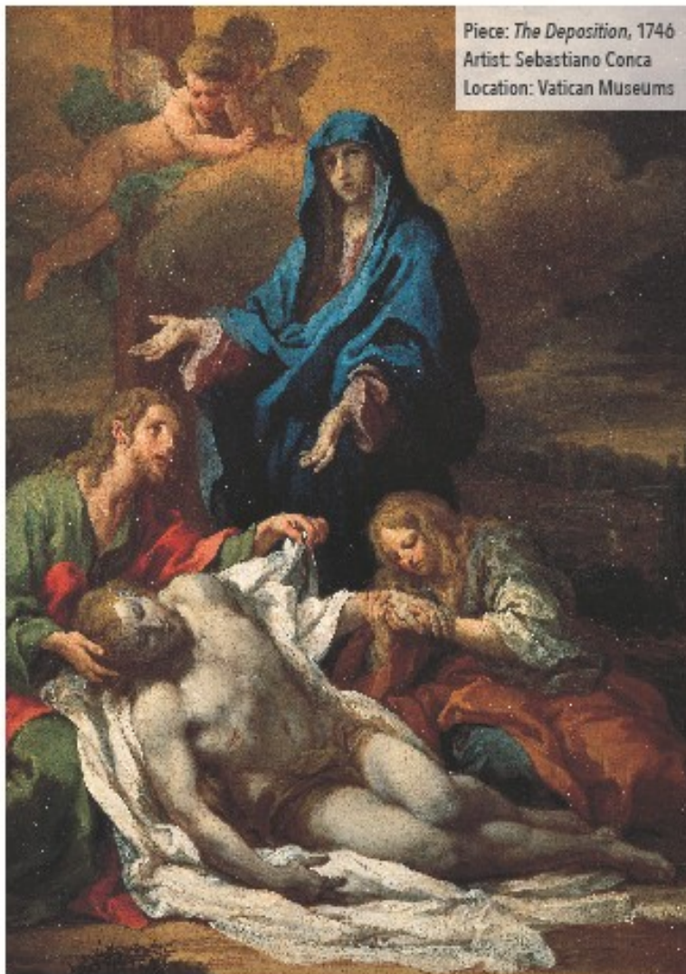
Piece: The Deposition , 1746 Artist: Sebastiano Conca Location: Vatican Museums