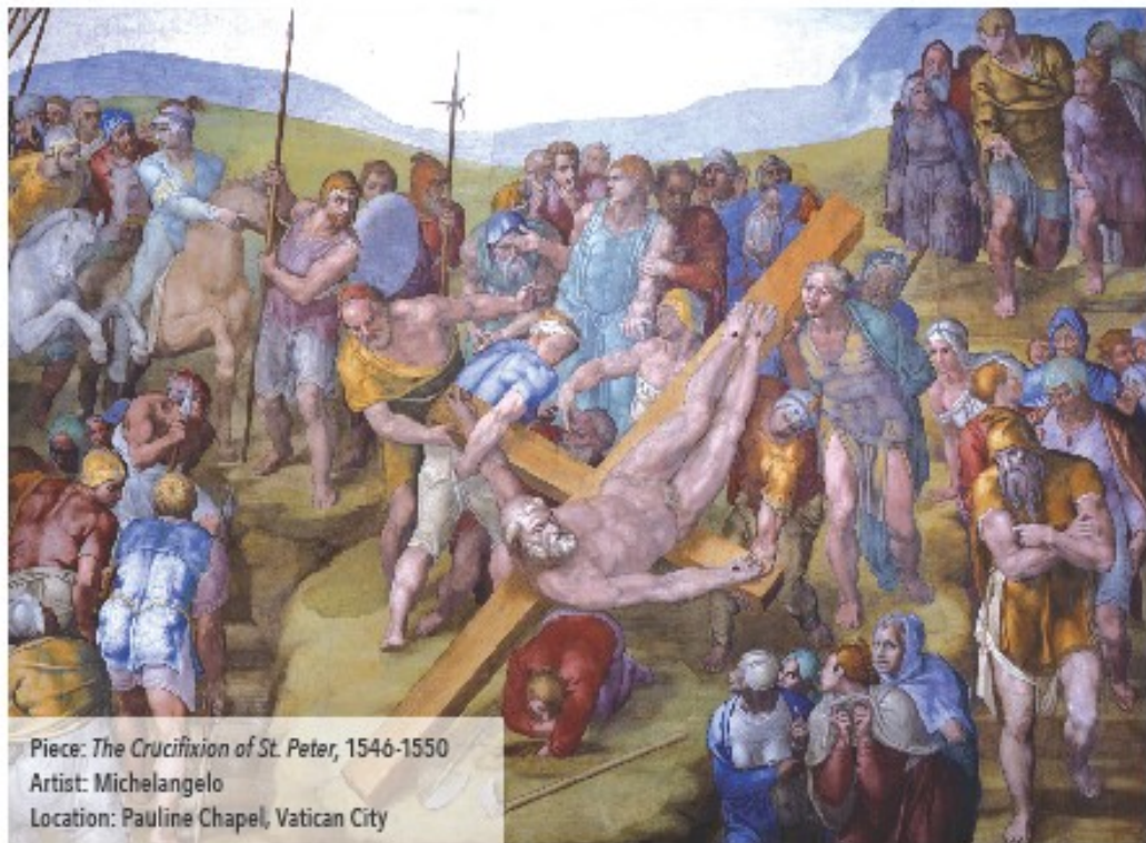
Piece: The Crucifixion of St. Peter , 1546-1550 Artist: Michelangelo Location: Pauline Chapel, Vatican City

Will that ideal last in time and into eternity? There is still time to adjust.