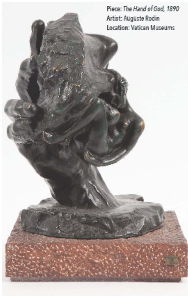
Piece: The Hand of God , 1890 Artist: Auguste Rodin Location: Vatican Museums

The Old Testament offers amazing tips on the