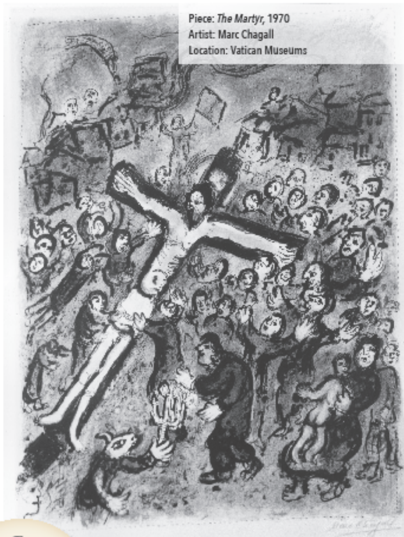
Piece: The Martyr , 1970 Artist: Marc Chagall Location: Vatican Museums

[Jesus said,] "I am the living bread that came down from heaven; whoever eats this bread will live forever."