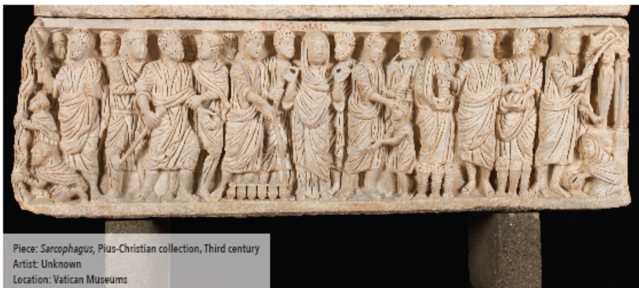
Piece: Sarcophagus, Pius-Christian collection, Third century

Am I generous with my time, treasure, and talent? Do I multiply what I have by giving it to God and others, allowing him to return it to me twelvefold?