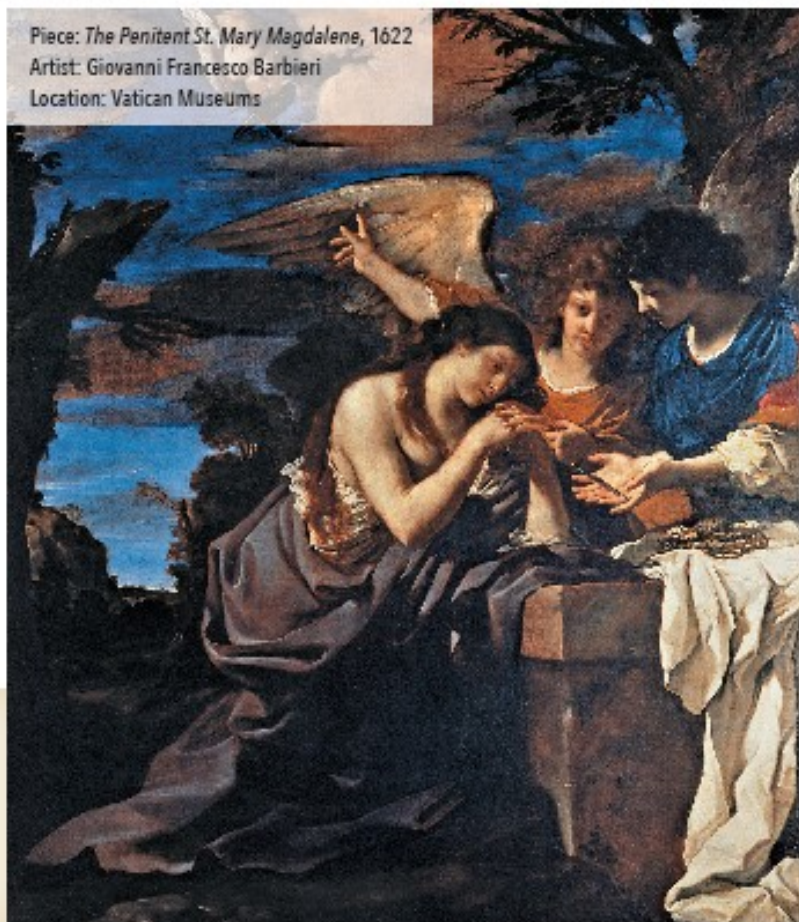
Piece: The Penitent St. Mary Magdalene , 1622 Artist: Giovanni Francesco Barbieri Location: Vatican Museums

His heart was moved with pity for them, for they were like sheep without a shepherd.