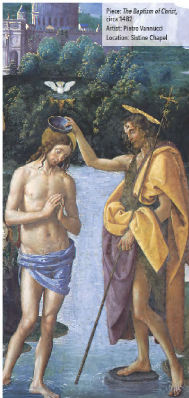
Piece: The Baptism of Christ , circa 1482 Artist: Pietro Vannucci Location: Sistine Chapel

How have I benefited from other people who have been generous with their own mission?