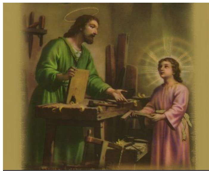
St. Joseph, Protector and Model, Pray for Us.

Stewardship This week's Second Collection is for Father's Day. Next week's Second Collection is for Peter's Pence. Bulletins of Jun 10, 17, 24 are early editions. Check the parish bulletin in the church for the collection amounts of Jun 3, 10 and 17. Thank you for your generosity.