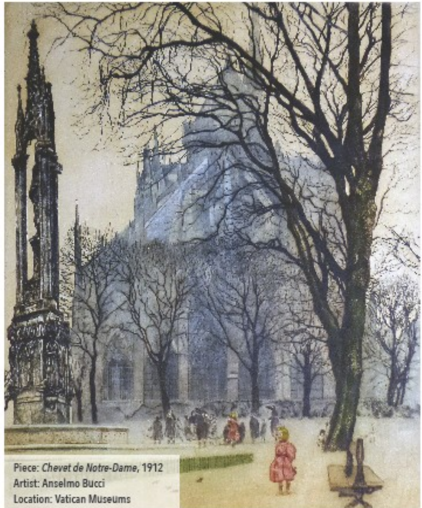
Piece: Chevet de Notre-Dame , 1912

The same can be said of the Church, Christ's kingdom of love. Christ planted the seed of faith in his apostles and that seed spread and thrived all across Europe. Their faith multiplied and grew until all throughout the world the fruits of their faith are on display as a veritable kingdom of charity: hospitals, universities, soup kitchens, AIDS hospices, shelters for the battered and homeless, retreat centers, chapels, churches, museums, research and rehabilitation centers, religious orders, lay associations, volunteer