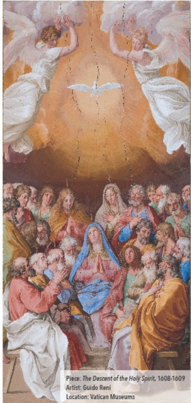
Piece: The Descent of the Holy Spirit , 1608-1609

Patience is a fruit of the Spirit. How can you practice more patience this week?