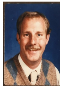
File photo of 1986

Thank You for 32 Amazing Years at St. John's!