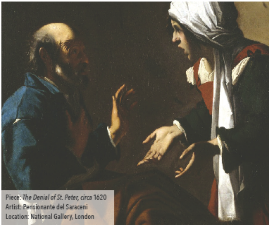
Piece: The Denial of St. Peter , circa 1620 Artist: Pensionante del Saraceni Location: National Gallery, London