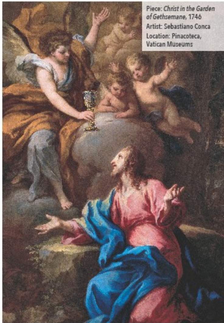
Piece: Christ in the Garden of Gethsemane , 1746 Artist: Sebastiano Conca Location: Pinacoteca, Vatican Museums

Gardens don't appear often in Scripture, but they are important. There is the Garden of Eden, the place of God's