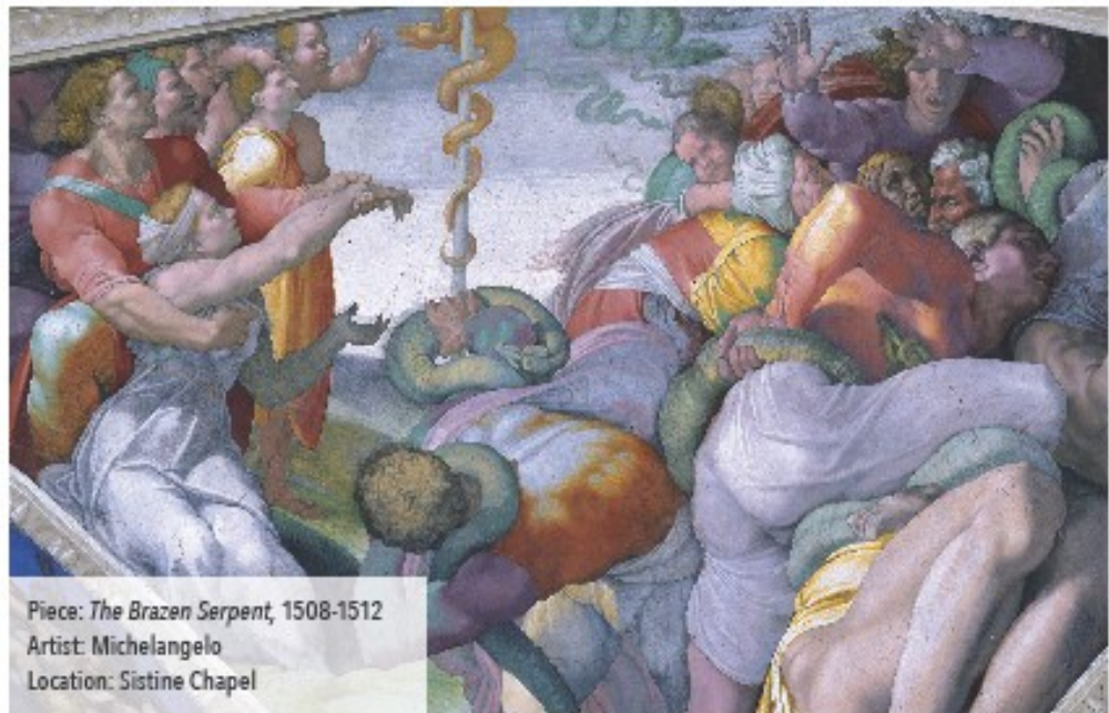
Piece: The Brazen Serpent , 1508-1512 Artist: Michelangelo Location: Sistine Chapel

Do I need to repent from whatever attitudes or actions distance me from that love?