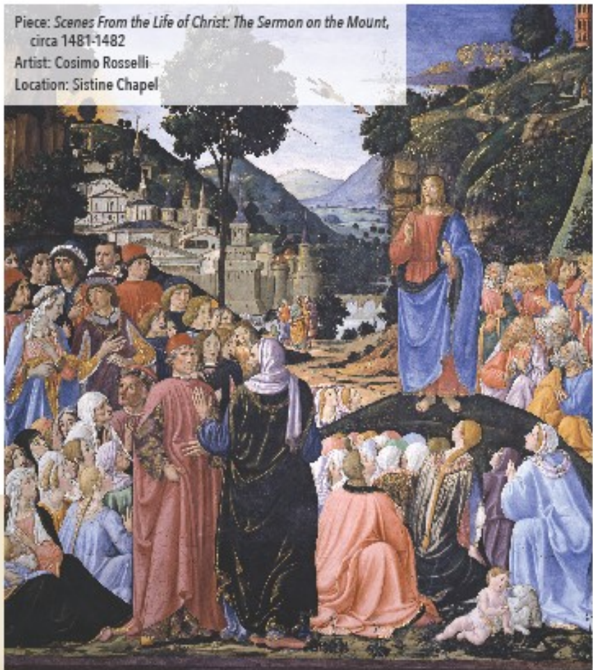
Piece: Scenes From the Life of Christ: The Sermon on the Mount , circa 1481-1482 Artist: Cosimo Rosselli Location: Sistine Chapel